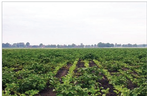
Figure 2: A Sugar Beet Field with a Severe Volunteer Potato problem