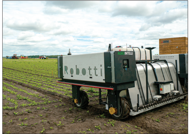
Figure 6: The autonomous 5G robot solution, developed by KPN and Wageningen University and Research (WUR)