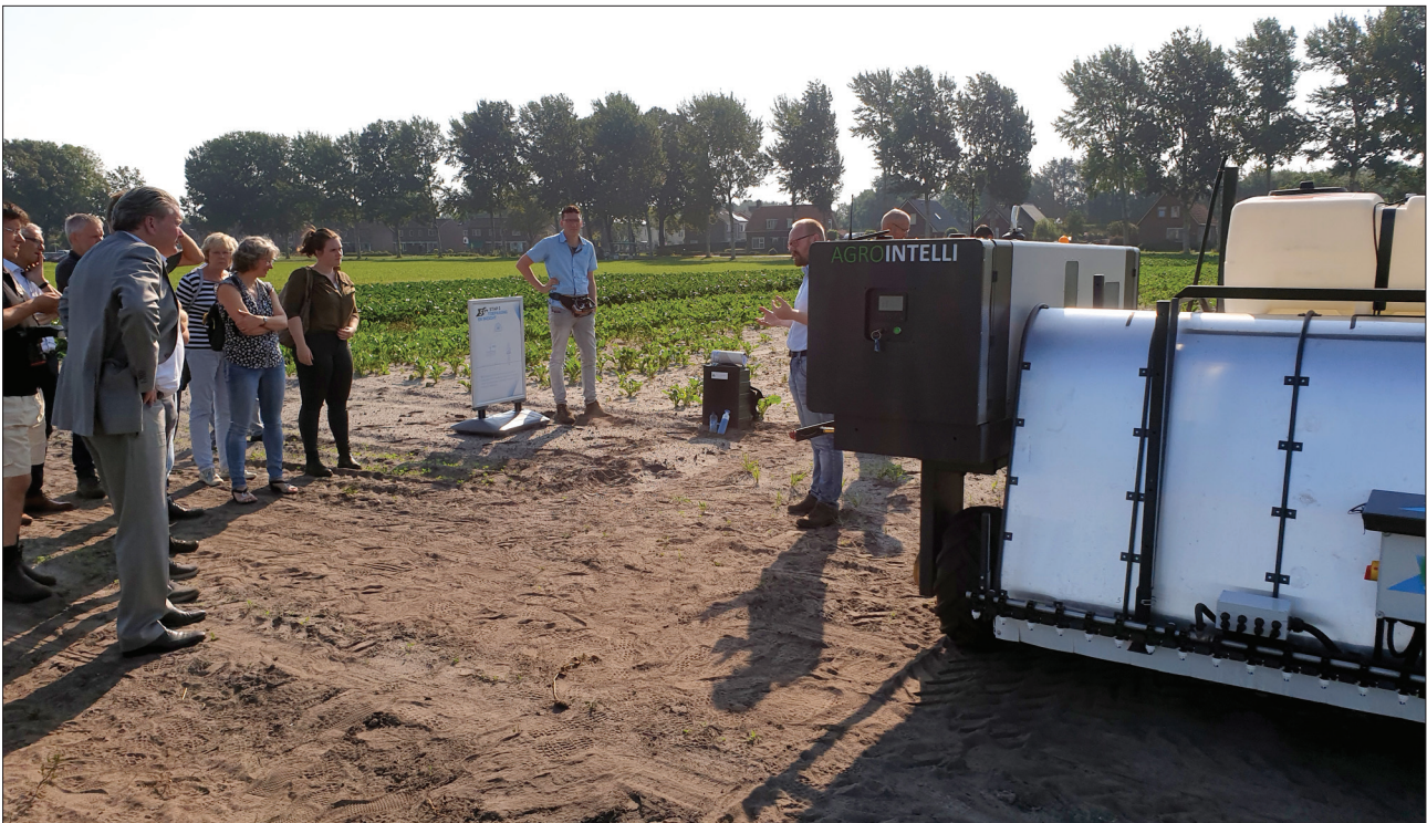
Figure 7: The autonomous robot IoT solution in a sugar beet field