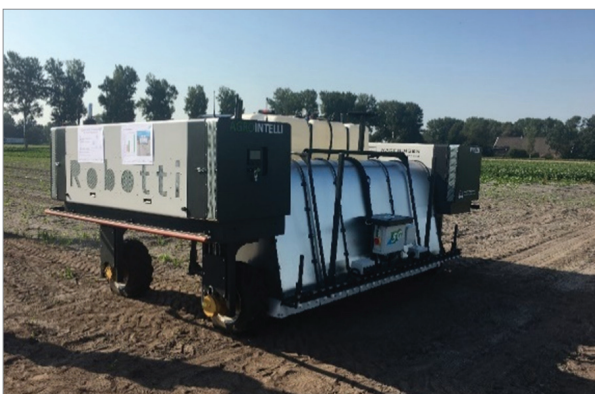
Figure 3: A Sugar Beet Field with Volunteer Potatoes

The use of edge computing enables the camera data to be offloaded and eliminates the need for a Graphics Processing Unit (GPU) at the robot. The practice of locating the GPU in a cloud edge server, processing data and returning a task to a moving robot in “real-time” is unique in the market. The required bandwidth to achieve this quickly enough, around 120Mbps upstream during peak moments, is not feasible without 5G, and the KPN 5G field lab has provided a test environment to demonstrate this possibility.