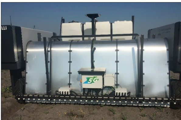
Figure 5: Autonomous Robot showing the tank containing herbicide above and 29 spray nozzles at the base near the ground.