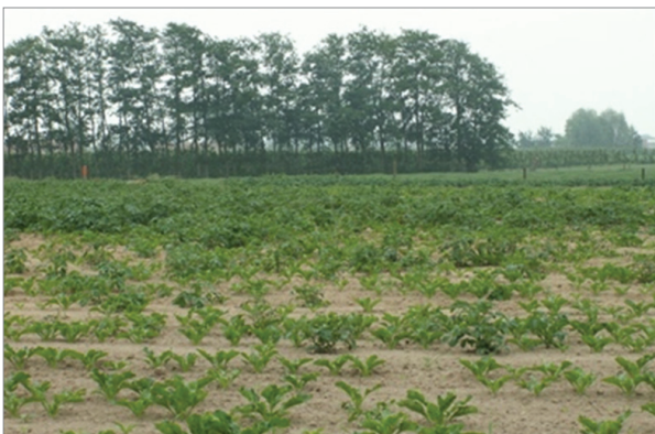
Figure 1: A Sugar Beet Field with Volunteer Potatoes

The most effective method of removal is through the manual application of glyphosate to the individual volunteer plants. This can take up to 40-60 hours/hectare*, costing an estimated 320-480 euros per hectare 4 , which is economically unattractive for the farmer. There is also a lack of workers that want to perform this type of work because it is extremely repetitive and it can be unpleasant to work in the field during a cold spring or hot summer.